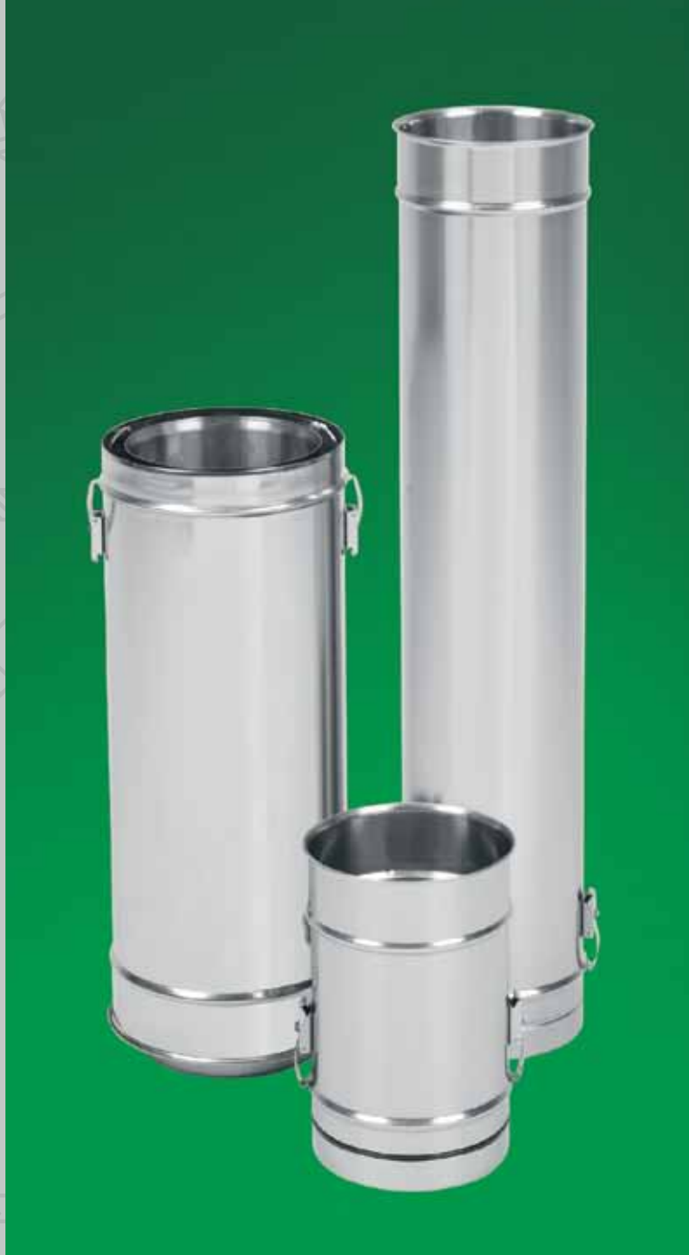
AL29-4C® Vent System for Category I, II, III, IV Gas-Fired Appliances-